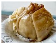
Apple Dumplings Sale