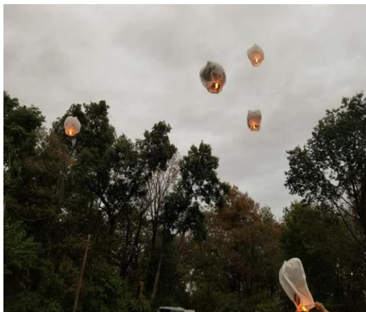
After reception Balloon Launch

A catered reception followed the service. Friends reunited and a slideshow of past memorable events was shown during the meal.